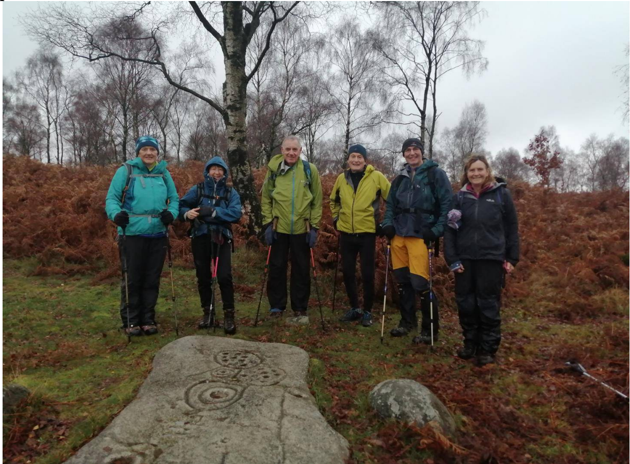
At the carved rock above Gardom's Edge.

Despite some rain and the odd injury we had a lovely day with plenty of catching up for Oreads from around the UK.