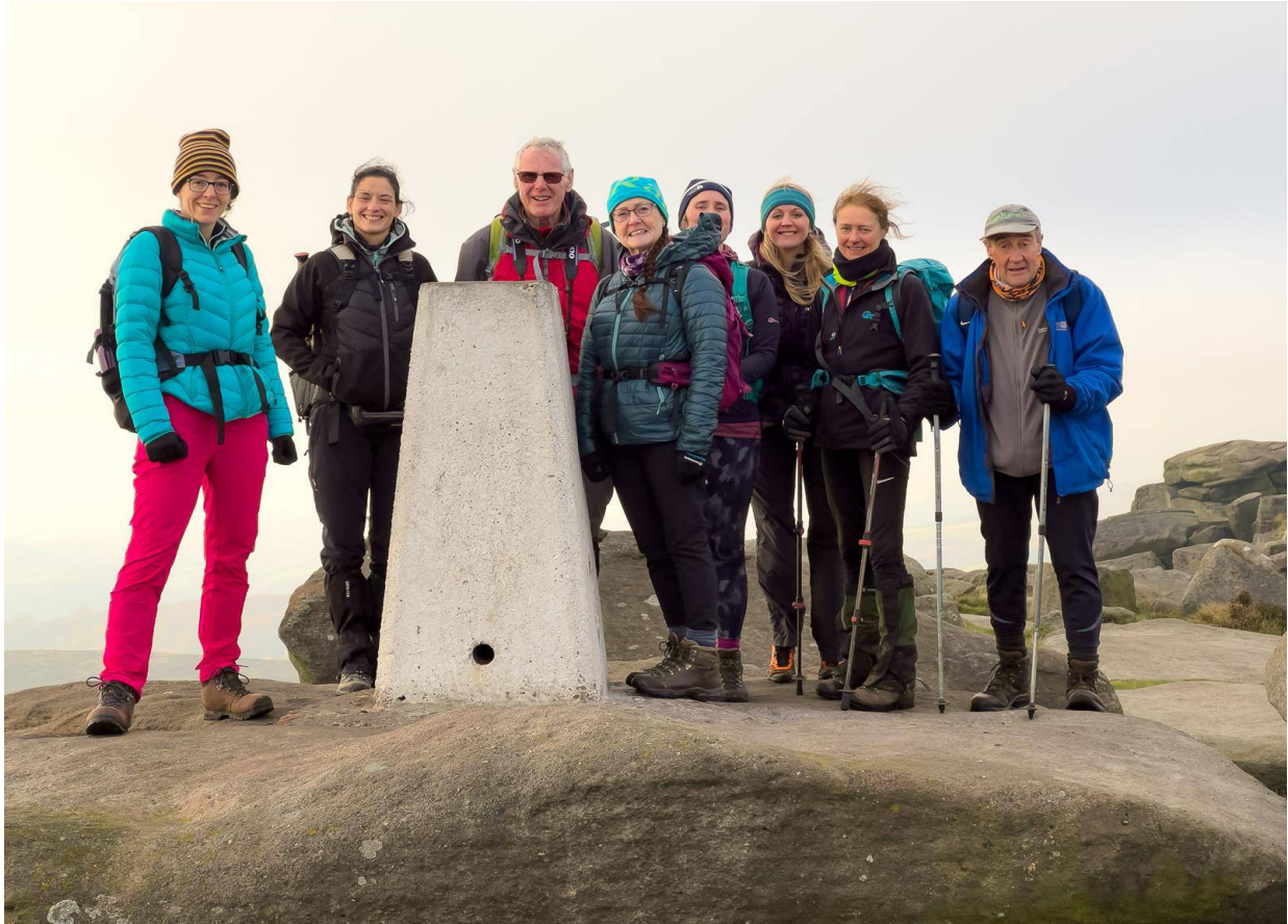
The team above Hathersage on the November Walk.